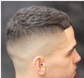
Less than a #2 cut.