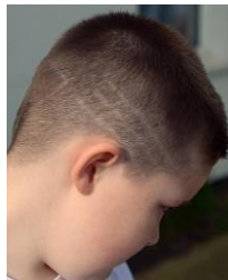
Tram lines shaved into hair.