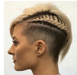
Large contrast between hair lengths visible.